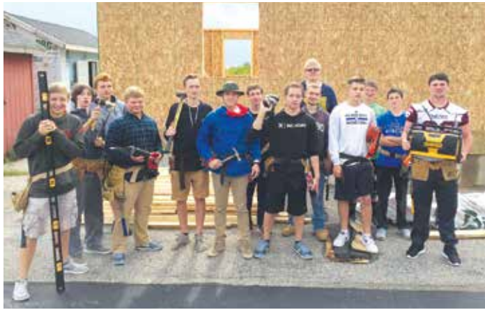
Charlevoix High School construction crew in front of our new building.

As I stood in front of the crowd of guests at our recent Moms & Tots Fund Raising Banquet, I was brought to a moment of wonder and awe. Looking at our nearly 370 guests made me think about what it would be like to have all of our active clients together in one room. What an impact! If we think about the families of those clients, that number could be multiplied by three or more times! That is a lot to ponder! God's faithfulness is evident!